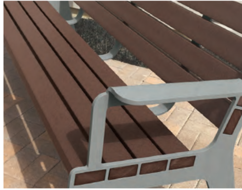
Anova bench is still beautiful after withstanding three Midwest winters.

Anova's premium recycled plastic will not split, rot, or crack over the years — guaranteed. Steel frames prevent planks from sagging.