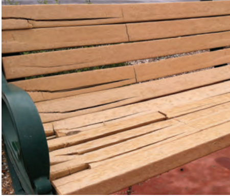
Competitor's bench is splitting, fading, and cracking.