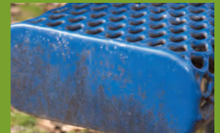
Mold & Mildew