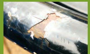
Chipping & Cracking